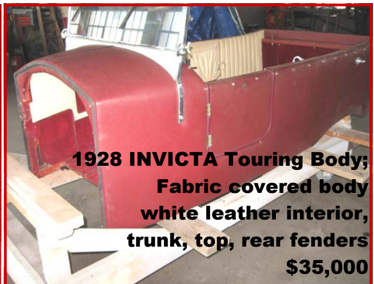
1928 INVICTA Touring Body; Fabric covered body white leather interior, trunk, top, rear fenders $35,000