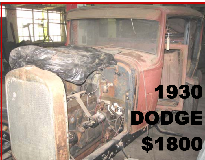
1930 DODGE $1800