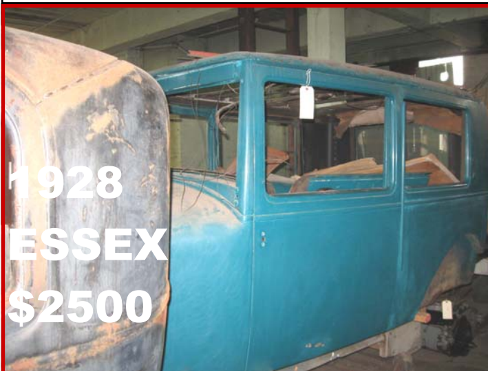
1928 ESSEX $2500

We also acquired many parts for antique and vintage cars, some of which are not yet identified. Feel free to come out & browse! Maybe you'll find what you need to finish your project!