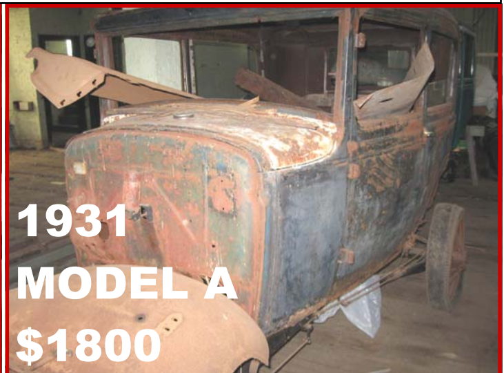
1931 MODEL A $1800